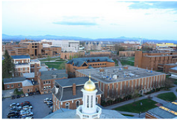
Fletcher Allen Health Care, Burlington, VT